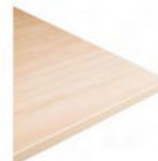
beech wood pre-laminated top with pvc flat edging