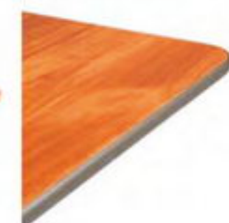
mahogany pre-laminated top with black pvc bull nose edging