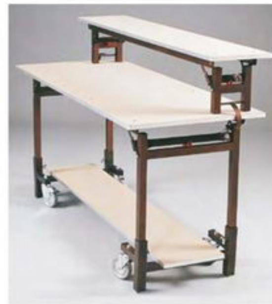
two-tier mobile buffet unit