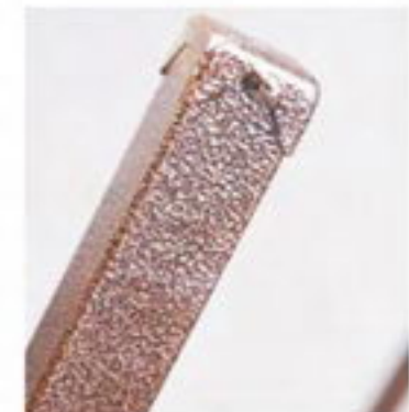
metal leg cap (plastic leg cap available)