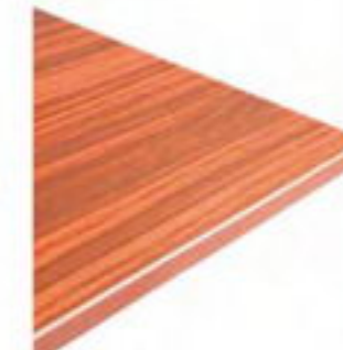
mahogany pre-laminated top with pvc flat edging