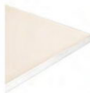
nylon flock top with aluminium edging