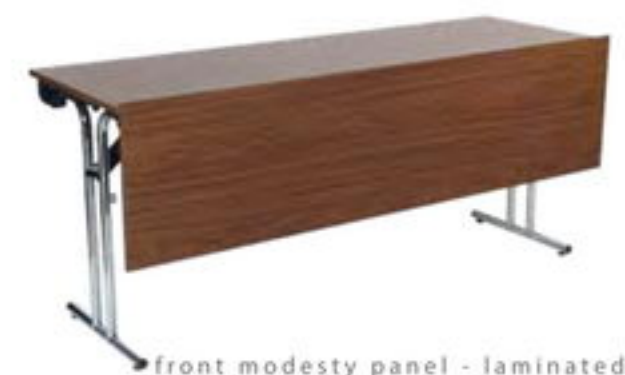
front modesty panel - laminated MDF