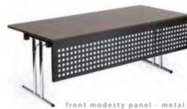
front modesty panel - metal