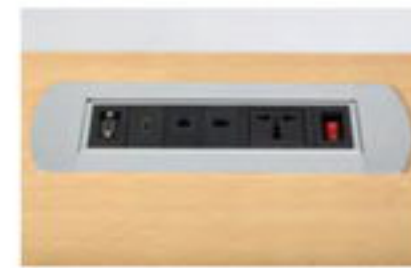
concealed power and data unit