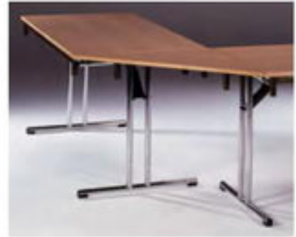
triangular corner section