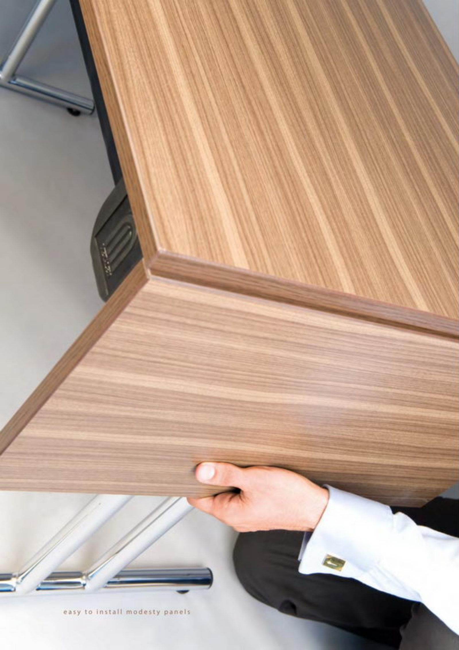
easy to install modesty panels