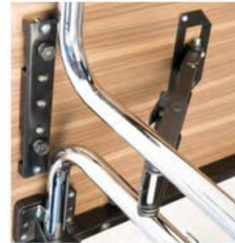
easy fold mechanism