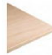
beech wood pre-laminated top with pvc flat edging