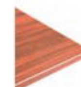
mahogany pre-laminated top with pvc flat edging