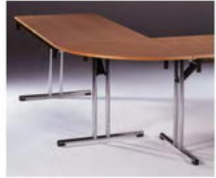
quadrant corner section