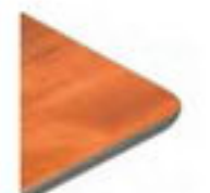
mahogany pre-laminated top with black pvc bull nose edging