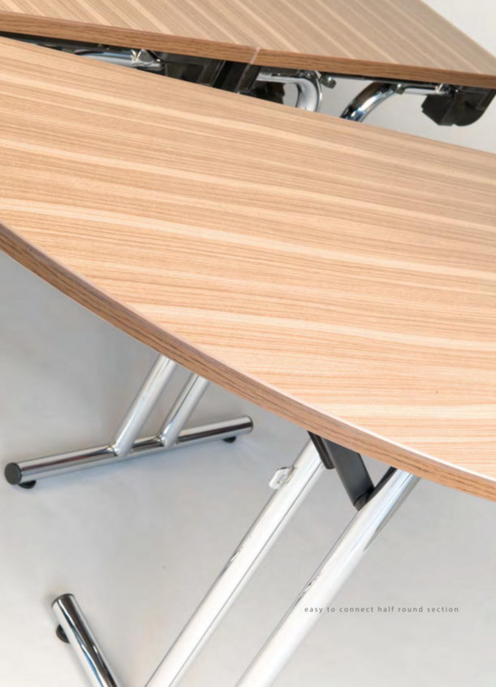
easy to connect half round section