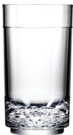
Elite HiBall Tumbler NEW 7030DR005 41.5cl (14oz)