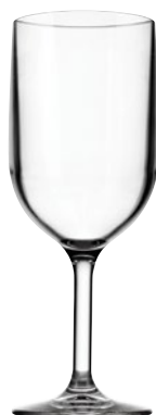
Elite Stemmed Wine 7030DR009 34.2cl (12oz)