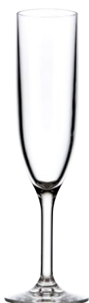
Elite Champagne Flute 7030DR008 17.0cl (6oz)

Drinique is proud to bring you its shatterproof champagne flute and wine glass. These elegant crystal clear wonders elevate stemware to new heights. Sleek and sophisticated, even empty these glasses are worth toasting.