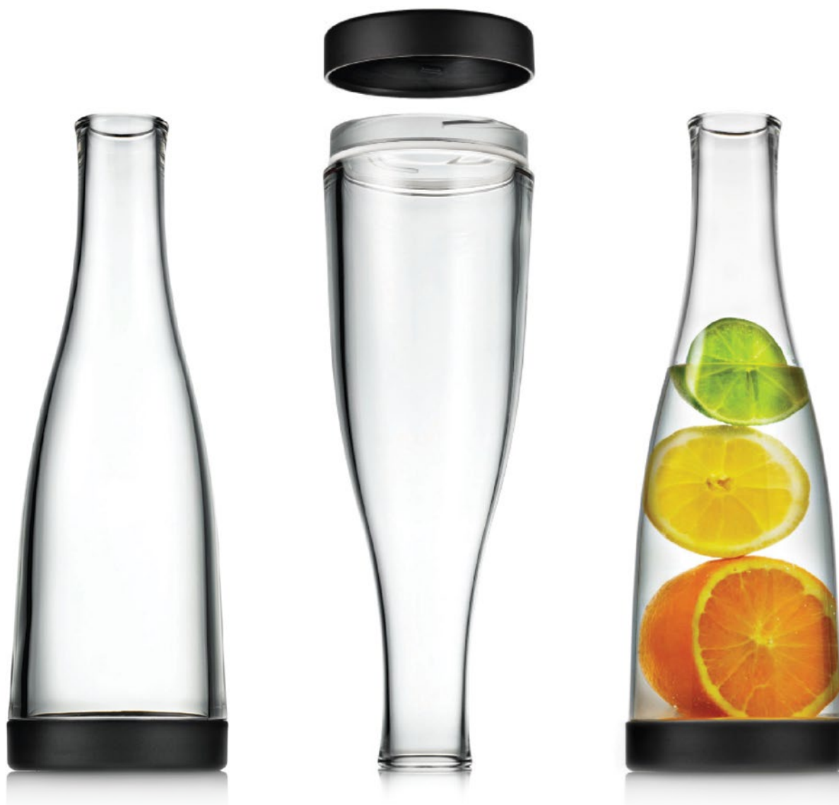
7030DR007 Elite Carafe 85.0cl (28oz) NEW