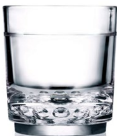
Elite Tumbler NEW 7030DR002 21.0cl (7oz)