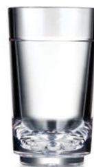
Elite Shot Glass NEW 7030DR001 6.0cl (2oz)