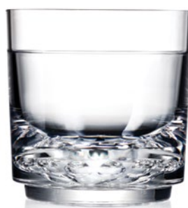
Elite Rocks Tumbler NEW 7030DR003 28.5cl (10oz)