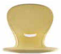
N - YLW