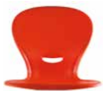
N - ORG