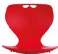
M - RED