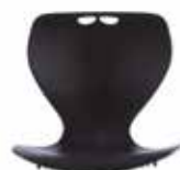
M - BLK