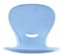
N - BLU