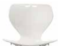
M - WHT