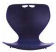
M - BLU