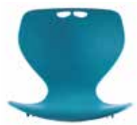
M - GRN