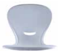
N - WHT