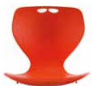
M - ORG