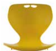
M - YLW