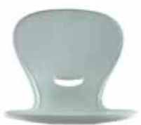
N - GRN