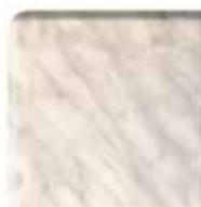
Marbre de Genes