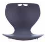
M - GRY