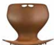
M - BRN