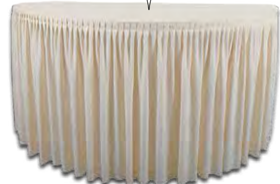
Table Cover Plisse (top cloth & Skirting stitched together